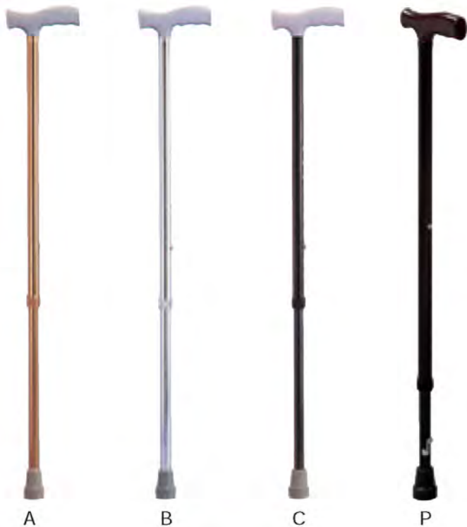
A B C P