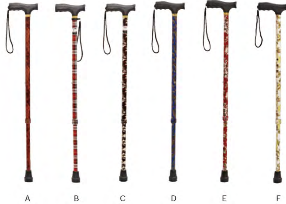
A B C D E F