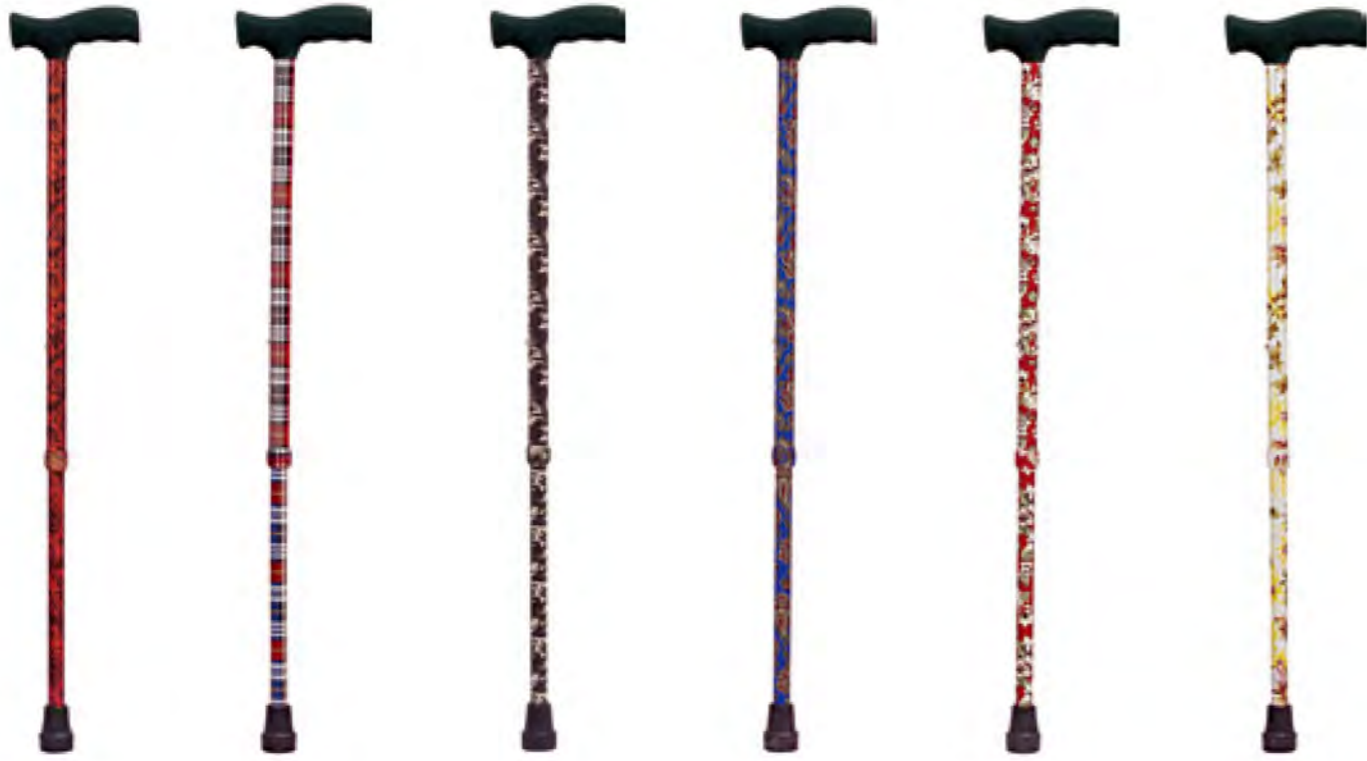
KJT919A >> KJT919B >> KJT919C >> KJT919D >> KJT919E >> KJT919F >>