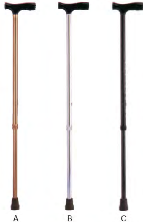
A B C

Optional addition of snowfield pin 可选配另加雪地钉